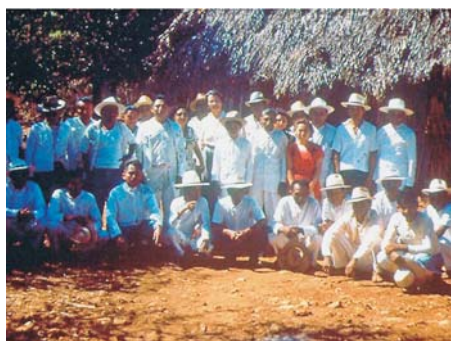
► Group of Maya at Xiu home 1951