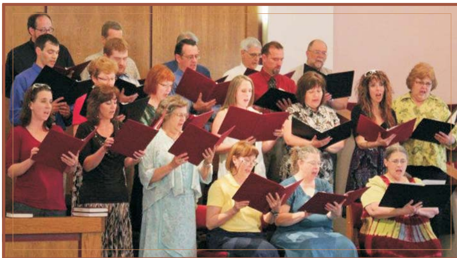
► Conference Choir