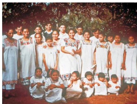
► 1st members - ladies - Dzan 1953